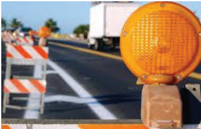
Road Improvements for Berrien, Nolan, Center, Flynn, Harbert, Hollywood, Indian Trail, Kaiser, Youngren, East, Goodwin and Townline