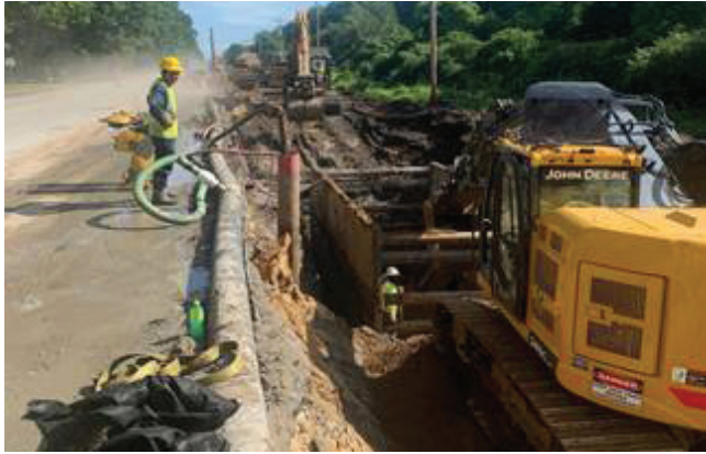
Red Arrow Highway Reconstruction from Main to Lakeshore