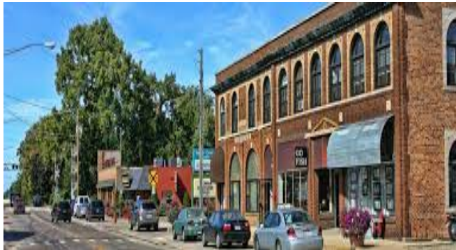
Sawyer Road Public Input and Preliminary Streetscape Design